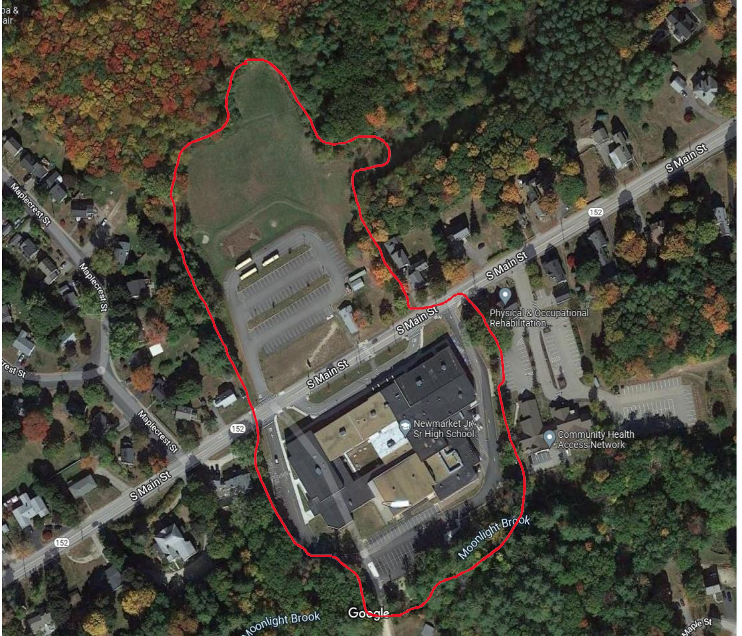
Exhibit B: Newmarket JSHS and Newmarket JSHS Annex/Parking Area